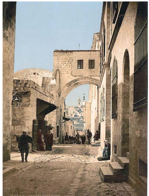
The Arch of Ecce Homo, Jerusalem, Holy Land

There is a strong sense in which those of us privileged to make this pilgrimage do so as much on behalf of others as for ourselves. It will be good for all of us who are pilgrims to bring back changed perspectives to share with others in time to come. Maybe my preaching and teaching will gain a new dimension.